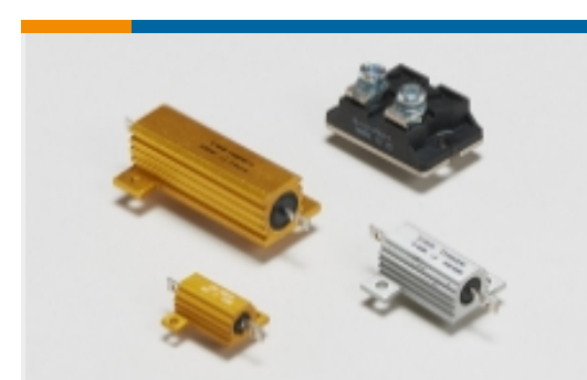
Chassis Mount Resistors(747)